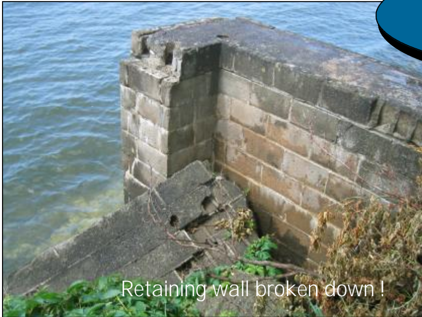
Retaining wall broken down !